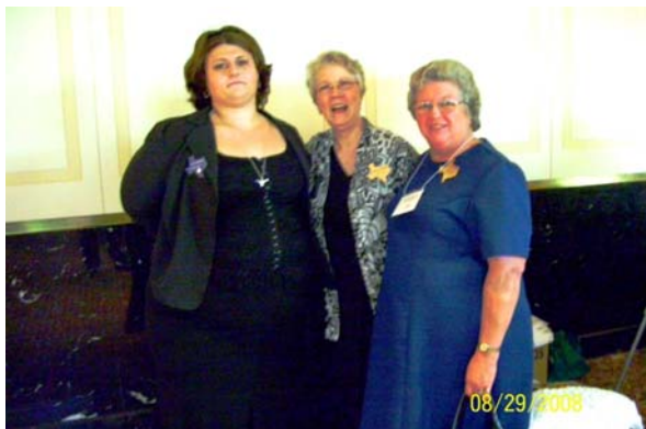
126th OES Grand Chapter theme "Symphony Among the Angels"